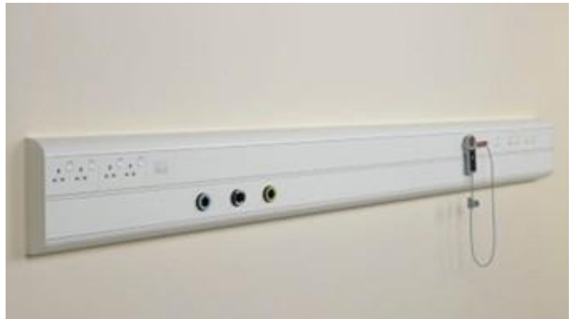
Typical Configuration - Horizontal Unit (H-SYS) With Two Tier